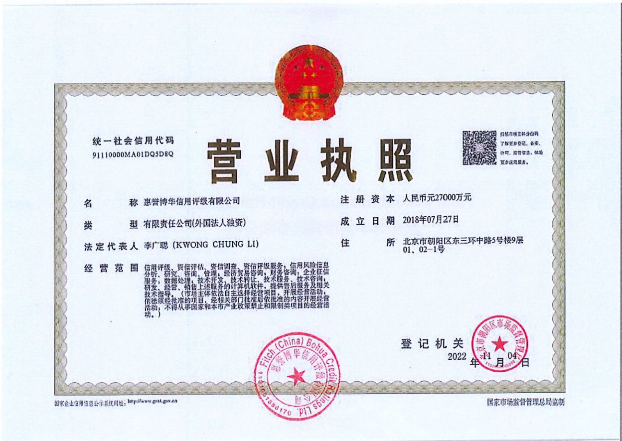
图 1 惠誉博华营业执照-副本